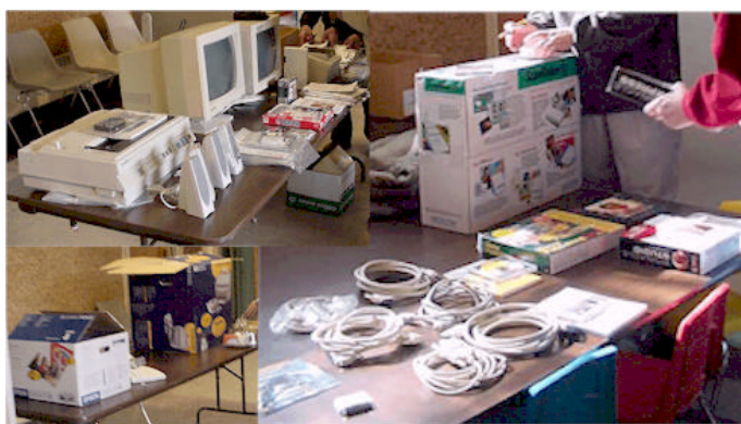
Good selections - Sales were made!

This was the slowest meeting I have attended in a long time. That was good, and the reason was Swapfest, as it provided the opportunity for much camaraderie.